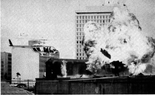
A climactic explosion from DARKMAN .

simple video, but it was very interesting. Iggy Pop is a very dynamic personality and there was a happy marriage between the way I like to make films and his performing style. He gives everything to the camera. I just wanted to try my hand on rock videos. I jumped back into the movies!